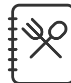
Food & beverage

Get in touch with our experts and book your Cisco Umbrella Innovation Centre Experience today